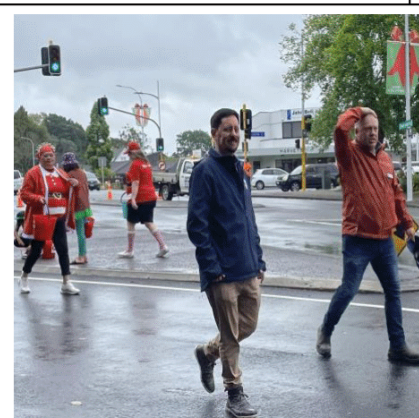
A couple of Local Board Members forgot their umbrellas! They both look a bit familiar!