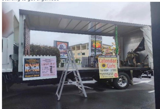
Starting to get organised